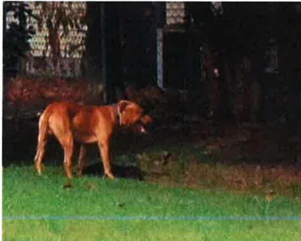
Brown pit bull standing over the black cat at 312 Nancy Street—the Castellanos's yard.