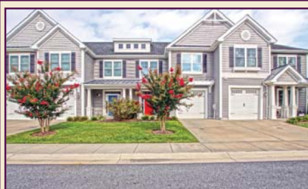
35104 ROEBUCK LANE, UNIT 26B BREAKWATER

MAKE YOURSELF AT HOME. Relaxing is easy amid low-maintenance luxury! Enjoy a great floorplan that offers two levels of spacious living with 3BR, including the master bedroom with a walk-in closet and private balcony overlooking the pond.