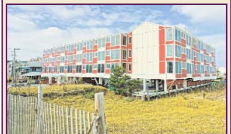
1 READ AVENUE, #114 SURF CLUB

DEWEY BEACH - A WAY OF LIFE. Make Dewey Beach a part of your life with fractional ownership of this efficiency unit! Fantastic opportunity to enjoy oceanfront living with the option to rent, or use personally almost any time. Recently upgraded.