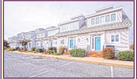
88 HENLOPEN GARDENS HENLOPEN GARDENS

UPDATED AND RENOVATED END-UNIT. Recent updates include: new flooring on the second floor and in the basement; granite countertops, kitchen faucet, dishwasher; new bathrooms; new HVAC system and water heater; and much more!