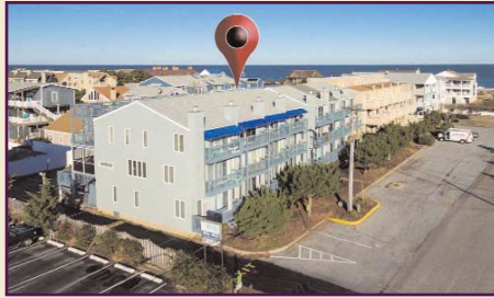
17 VAN DYKE STREET, UNIT B EMERALD SHOALS

FURNISHED OCEANBLOCK TOWNHOME. Furnished, turn-key, 4BR, 3.5BA home with remodeled kitchen, screened porches, balconies, and top deck. Patio with outside shower, storage. Reserved parking for two. Strong rental history.