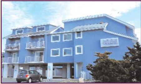
1406 COASTAL HIGHWAY, 3I THE DELANO

OCEANBLOCK IN DEWEY BEACH! This furnished, 3BR, 2BA, two-story condo is ready as an investment or personal use. Features numerous upgrades and two assigned covered parking spaces.