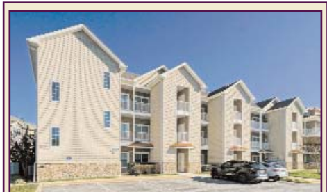
17476 SLIPPER SHELL WAY #2 SANDBAR VILLAGE

INVEST AT THE BEACH! Enjoy 3BR ~ including spacious master with walk-in closet & en-suite bath, great room with FP ~ central to kitchen with granite counters & pantry, and light-filled sunroom that leads to the rear patio with pondviews.