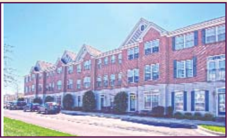
17405 N. VILLAGE MAIN BLVD VILLAGES OF FIVE POINTS

ENJOY THE VILLAGE LIFESTYLE. Spacious 3BR townhouse features an open floorplan with tile and hardwood flooring, eat-in kitchen, extra-large third-floor master suite with a huge walk-in closet, two additional second floor BRs, and more.