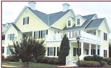
32399 BACK NINE WAY #3753 BAYWOOD

LARGE END-UNIT TOWNHOME provides 3BR, 3.5BA, views of 18th hole, pond, clubhouse. Includes gourmet kitchen, full unfinished basement. Community features resort-style amenities. Just a short drive to beach attractions.