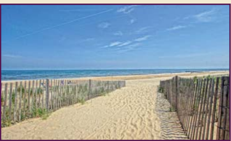
11 VIRGINIA AVENUE, #204 THE CREST

REHOBOTH OCEANBLOCK CONDO. This 2BR condo has a proven rental history. Recently painted. Desirable 15-unit condo features a sparkling pool, secure entrance, elevator, storage space, off-street parking, and on-site laundry.