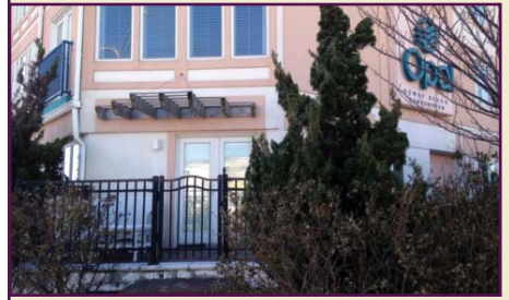
1609 COASTAL HIGHWAY, #105 THE OPAL

GRACIOUS LIVING AWAITS! Furnished, Contemporary, 4BR, 3BA townhome in the center of everything, between the ocean and the bay. Two parking spaces; community pool.