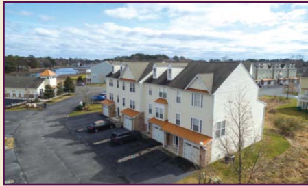
34 PIER POINT DRIVE, #53 CREEKSIDE

4BR, 3.5BA END-UNIT TOWNHOME in amenity-rich community less than 3 miles to Bethany Beach. Perfect year-round home or rental opportunity.