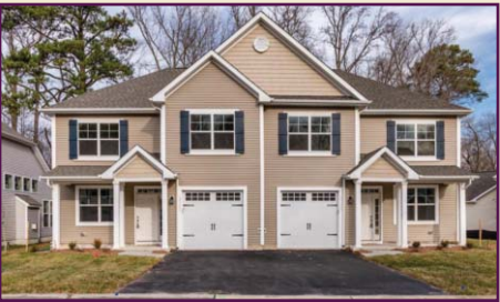
29223 SHADY CREEK LANE, # 30 WOODLANDS OF PEPPER CREEK

NEW CONSTRUCTION BACKS TO WOODED SETTING 3BR, 2.5BA townhome features open floorplan with dining room, great room, first-floor master bedroom, loft. Community located in downtown Dagsboro.