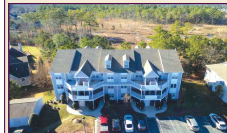
37514 PETTINARO DRIVE, #9404 BETHANY BAY

AMENITY-RICH GOLF-COMMUNITY Partially furnished, 2BR, 2BA condo with screened porch, updated appliances, one-car garage. So close to beach and downtown Bethany. Community pool, tennis, basketball, golf, boat launch, kayak launch.