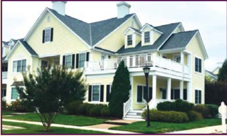
32399 BACK NINE WAY BAYWOOD

LARGE END-UNIT TOWNHOME provides 3BR, 3.5BA, views of 18th hole, pond, clubhouse. Includes gourmet kitchen, full unfinished basement. Community features resort-style amenities. Just a short drive to beach attractions.