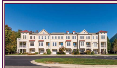
21087 LAGUNA DRIVE, #D4 SAWGRASS AT WHITE OAK CRK

OPPORTUNITY KNOCKS! 3,200SF townhome with 3BR, 2 full BA, 2 half BA; many upgrades such as ceramic and hardwood flooring, granite counters, double-sided gas FP; back patio. Located in amenity-rich community.