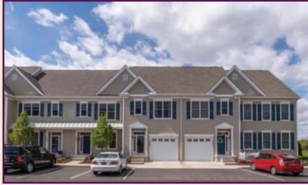
18832 BETHPAGE DRIVE, #4F HERITAGE VILLAGE TOWNHOMES

PRIDE OF OWNERSHIP 3BR, 3.5BA townhome backing to golf course. Features open living design, abundant storage, one-car garage. Conditioned crawlspace. Community pool. Close to shopping, dining, entertainment.