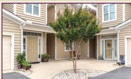
137 ROCK LEDGE COURT, #6303C HEARTHSTONE MANOR

BEAUTIFULLY REMODELED AND UPGRADED HOME Second-floor unit features 3BR, 2BA, custom paint, hardwood floors in main living area, Florida room, spacious MBR, upgraded kitchen, and room for storage. Community amenities.