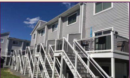
107 COLLINS AVENUE, #501 THE COVE

BAY AND MARINA VIEWS This furnished, turn-key 4BR, 3BA condo features meticulous renovation: kitchen with granite finishes; new windows and doors; skylights; FP; new roof, Trex steps and patio. Community pool. Great rental-investment.