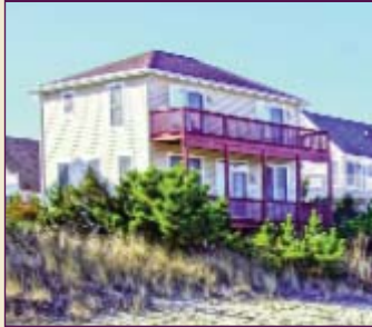
UNOBSTRUCTED WATERVIEWS 2BR, 2.5BA home. $649,900