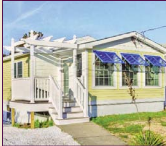
TURN-KEY COTTAGE Furnished, 2BR, 2BA. Renovated 2019. $439,000