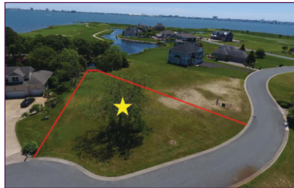
LOT 38 FOX RIDGE COURT LIGHTHOUSE SOUND

TWO-ACRE WOODED LOT Build your dream home with no builder tie-in. DNREC-approved site evaluation for gravity-fed system. $135,000