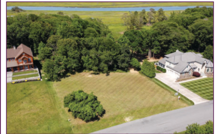
35881 TARPON DRIVE WOLFE POINTE

WELCOME TO THIS PREMIER COMMUNITY 1900 sq ft lot offers views of Ocean City, Assawoman Bay and the 6th green. $440,000