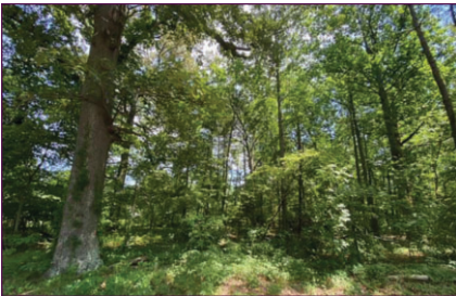
DEEP BRANCH ROAD GEORGETOWN

TWO-ACRE WOODED LOT Build your dream home with no builder tie-in. DNREC-approved site evaluation for gravity-fed system. $135,000